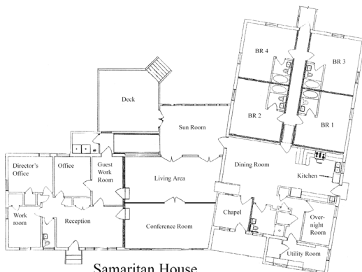
Samaritan House 611 FORTUNE STREET CHARLOTTE, NORTH CAROLINA

Plan on being with us in late May when the moving van rolls up...and we start a new phase of living our mission to be "A Healing Haven for People who are Homeless"